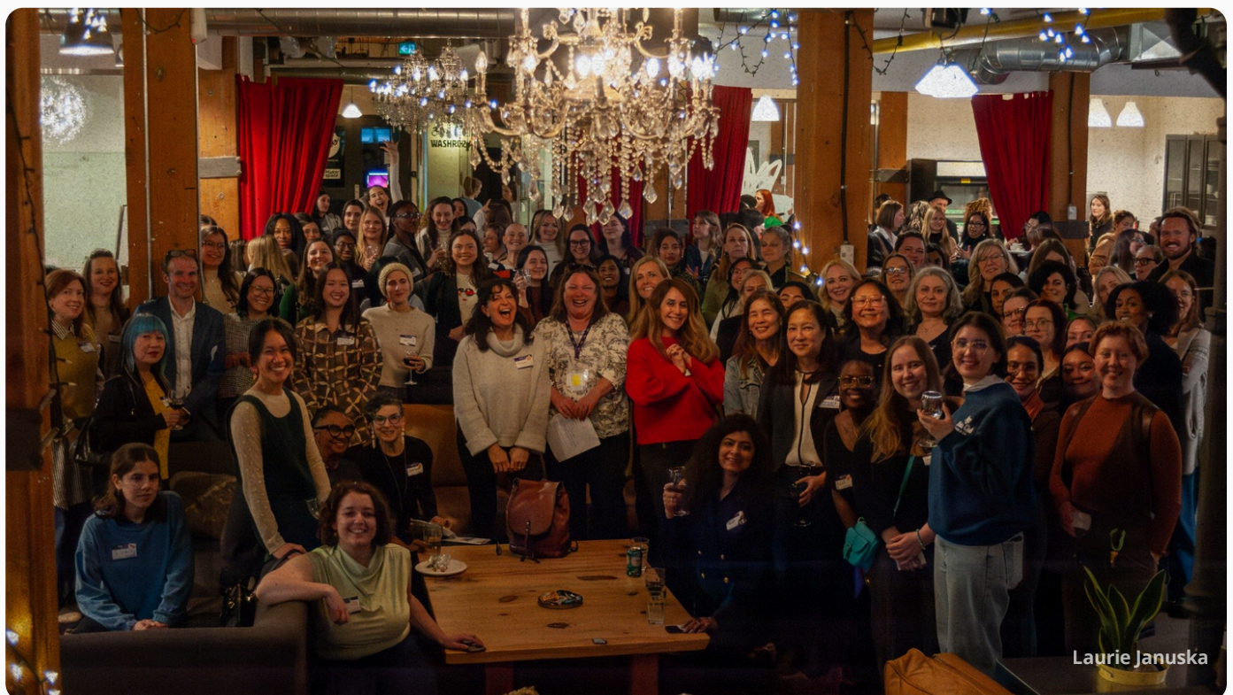
WIFT+ Toronto members attending the Great Networking Event

This year, more than 200 WIFT+ Toronto members from across the screen-based industry came together, representing emerging talent, established leaders, and dedicated supporters of the organization. We look forward to continuing this event as an annual tradition.