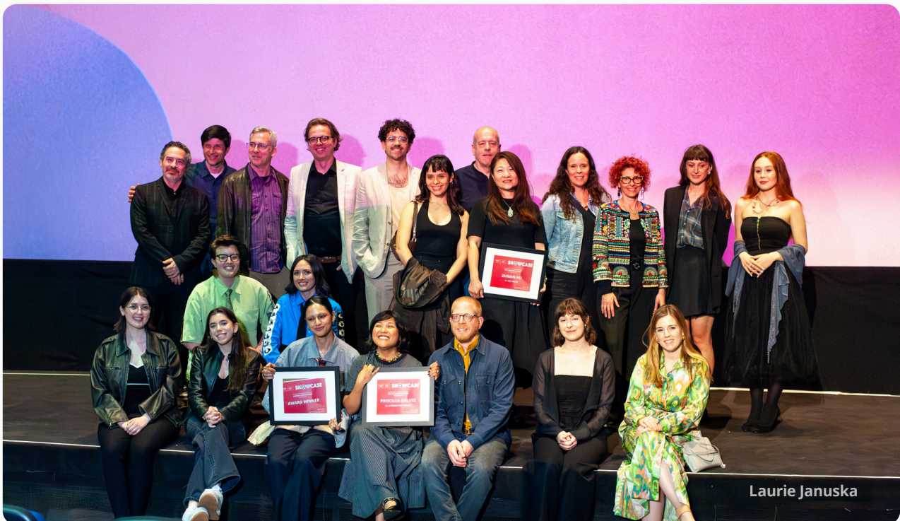
2025 Showcase Filmmakers