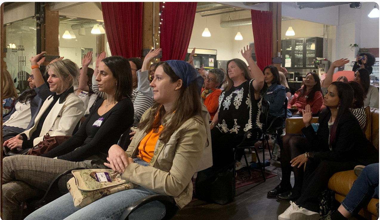
WIFT+ Toronto members participating in the 2025 AGM