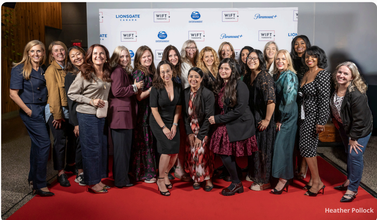
Members of the WIFT+ and FDN board attending the Reception@TIFF

Thank you to our Major Sponsor, Spin Master Entertainment ; Supporting Sponsors, Lionsgate Canada, Paramount+ ; Event Sponsors, Banff World Media Festival, Boat Rocker Media, Bushmills, Coffin Ridge Boutique Winery, M.A.C., Maestro Dobel Tequila, Playback, Red Tape Brewery, and Techno Medic Ltd.